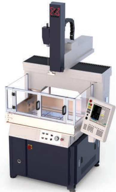
Model Shown: SY-4060R

Adjust the high pressure flush pressure through the electrode with a G-Code in the part program